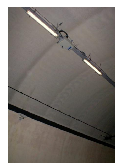
The monitoring station installed on the vault of the tunnel