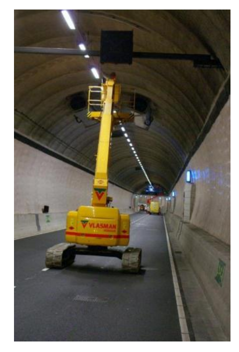
Aerial lift utilization to fix the Optical Strand in the tunnel

Thanks to OSMOS the client will be able to follow his structure behavior without stopping the road traffic.