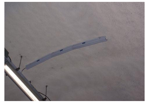
Optical Strand's installation on the tunnel underface vault with it PVC protection